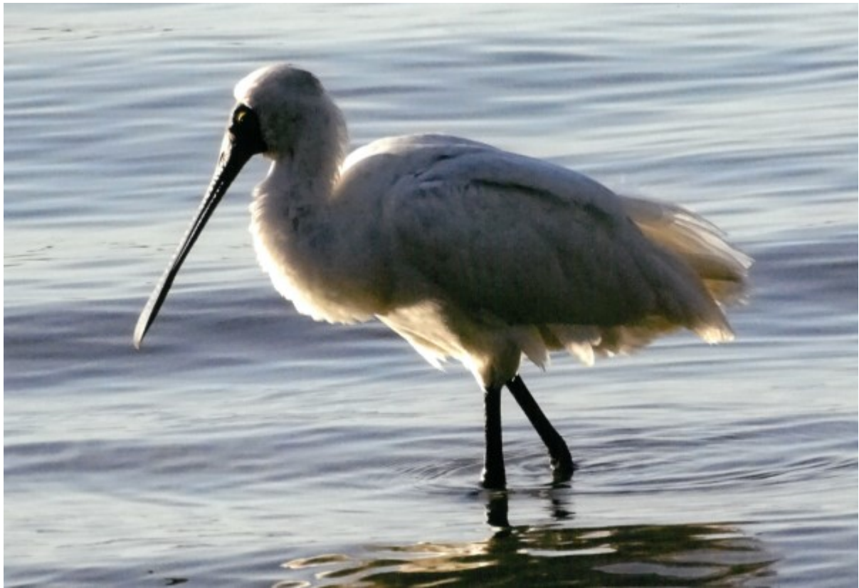
2020 Conference Photo Competition - Brian Witton, Auckland branch

Check out the website for more on the project.