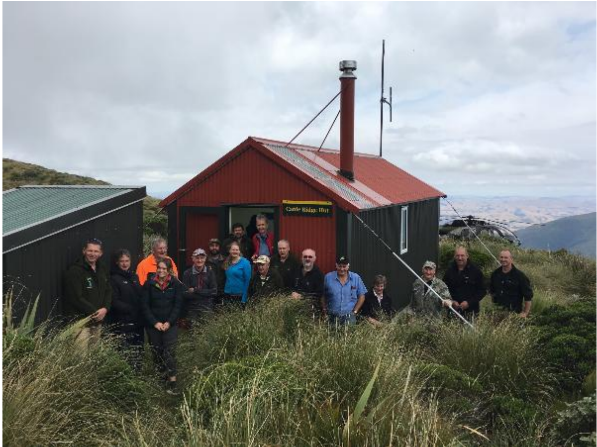
NZDA Wellington Branch (pictured) recently opened the refurbished Cattle Ridge Hut in the Taranukas.