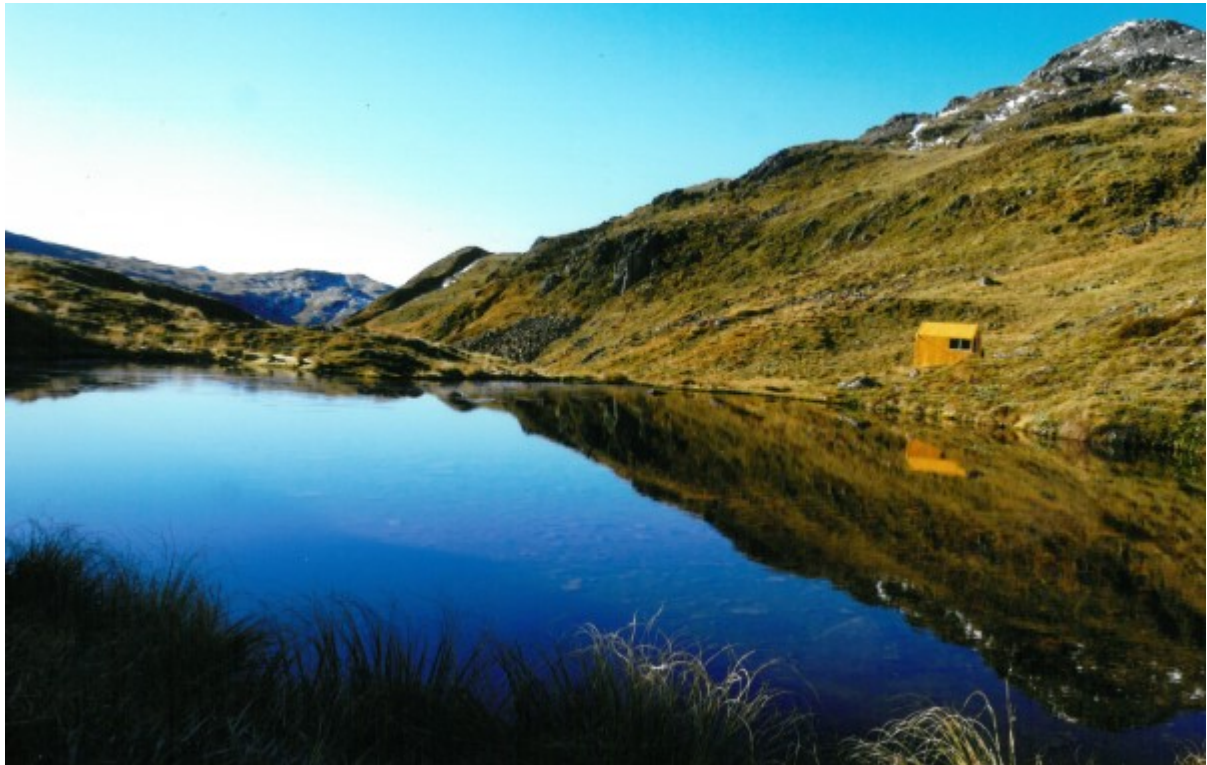
2020 Conference Photo Competition - Warren Hall, North Canterbury branch