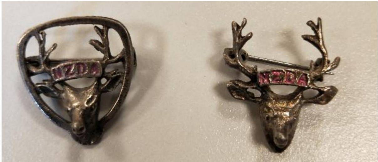
Rare pre-1957 NZDA membership badges

Have you seen either of these badges? The NZDA National Heritage Trust seeks a donation of above for inclusion on a display board of the Association's Badges.