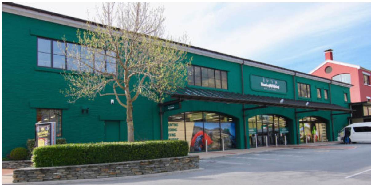
Hunting and Fishing will host the friday night function.

For full details, ticket sales and a copy of the registration forms, visit the Southern Lakes Website here .