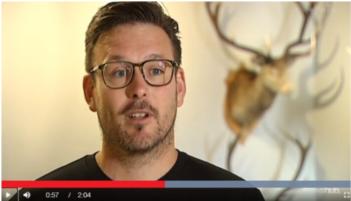
Click here or the image above to watch the full Newshub interview featuring Gwyn.