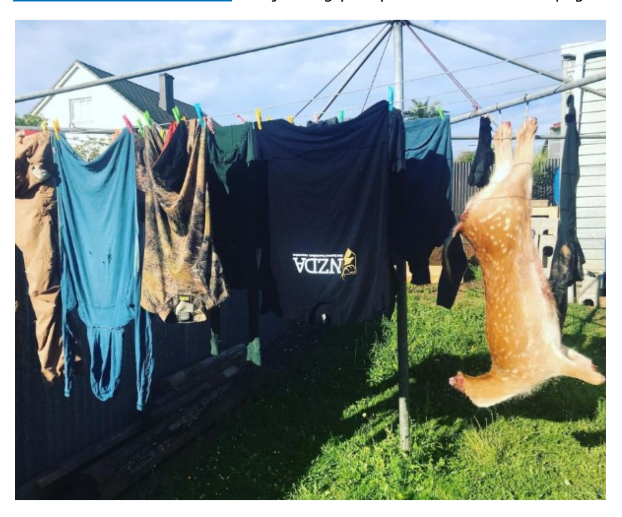
Instagram - @chaseandgather

For your chance to be featured, follow <a>@NZDANational</a> and <a>@nzdeerstalkersassociation</a> and just tag your photo to either of the pages.