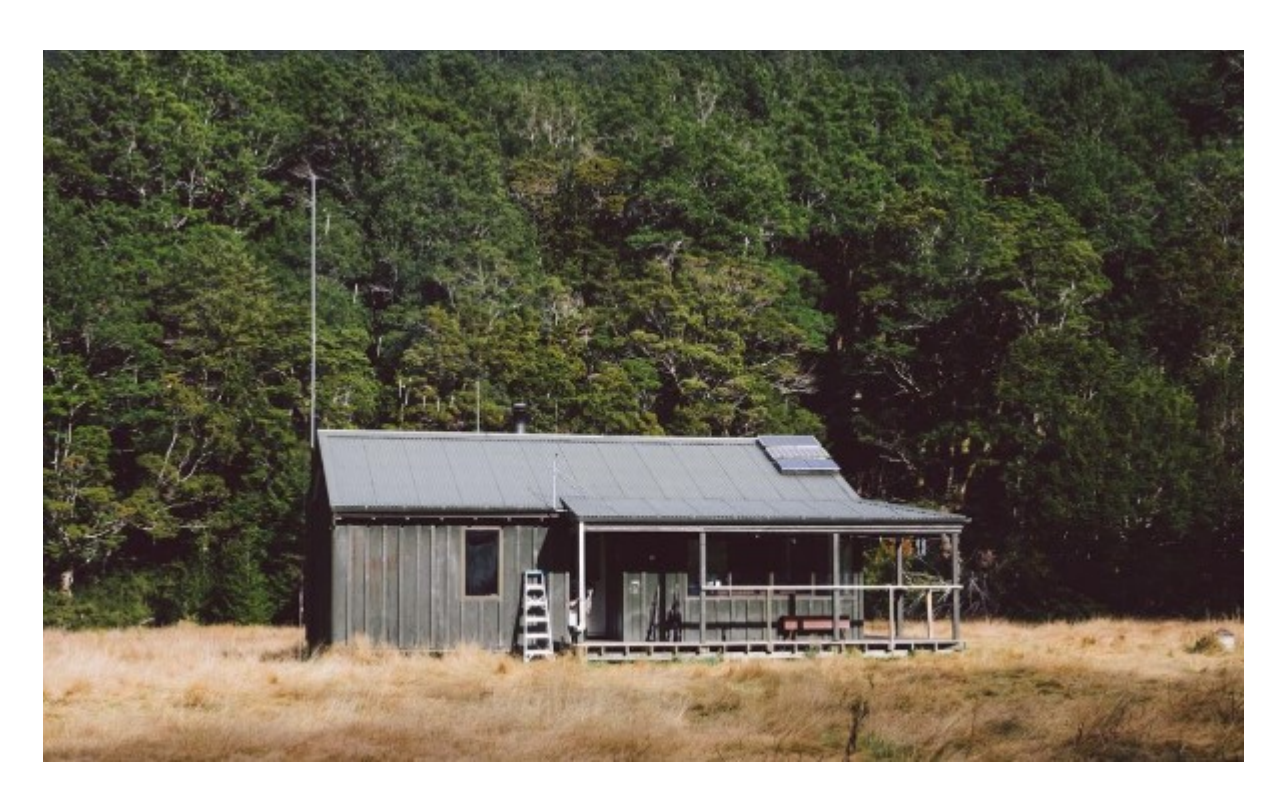
Instagram - @jasonckelly