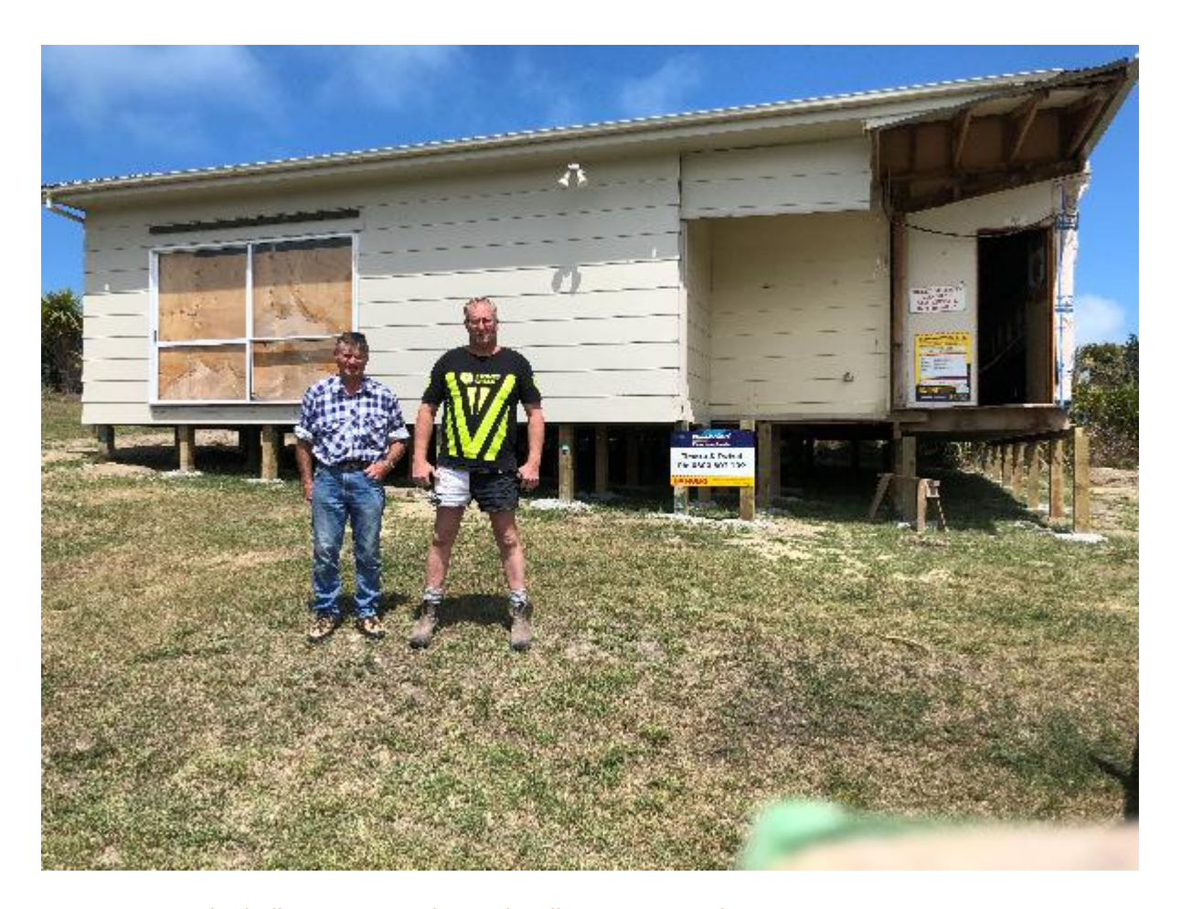
The hall on its new piles and well on its way to hosting meetings again.