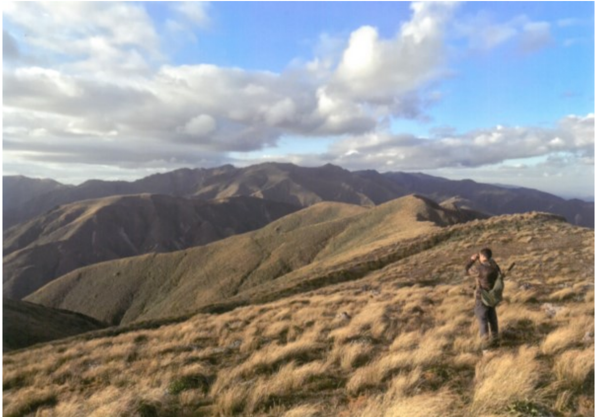
2020 Conference Photo Competition - Tom McCowan, Wellington branch