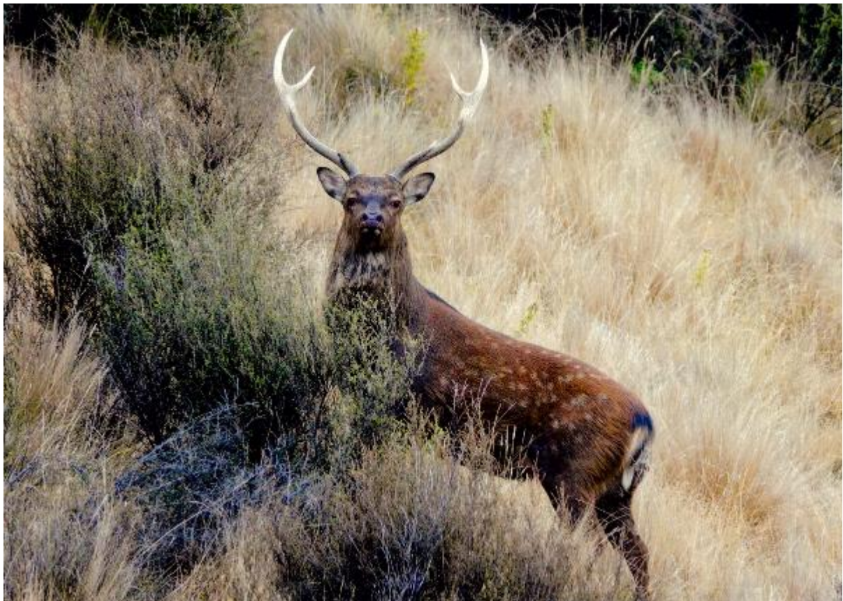
Game Animals, 2021 National Photographic Competition