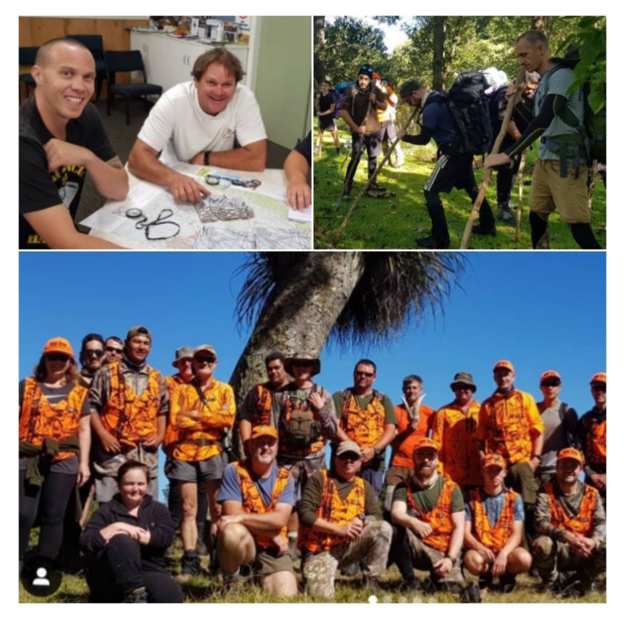
Instagram - @nzdawaikato - 2021 Hunts Course