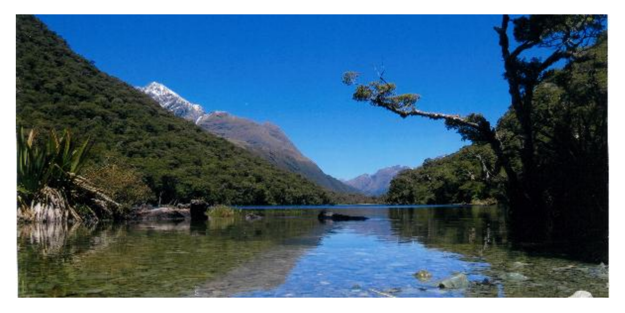
Lake Howden (Joshua Keen, South Canterbury)