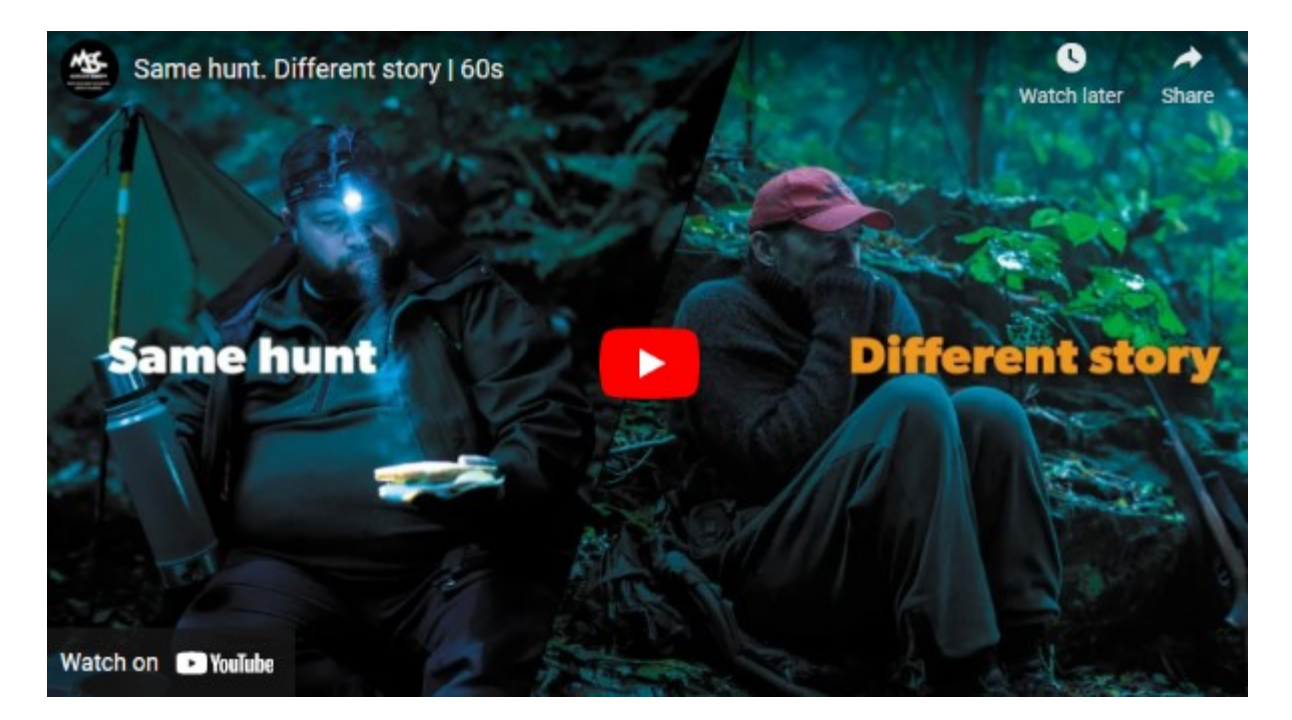
Click above to watch the full video.