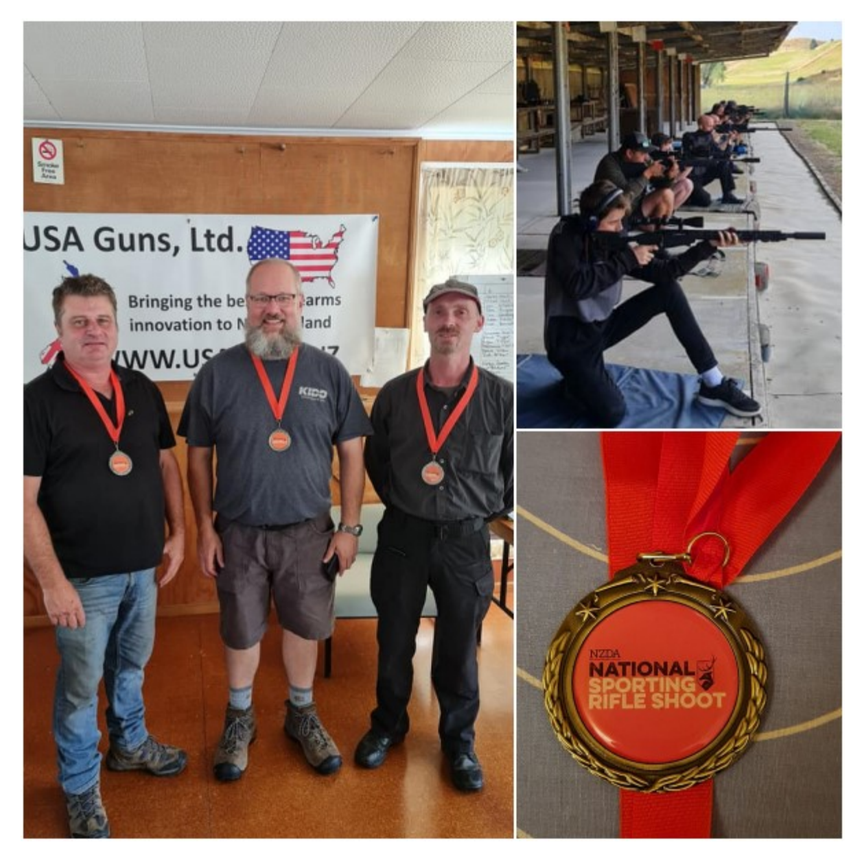
Some images of the shooting event.