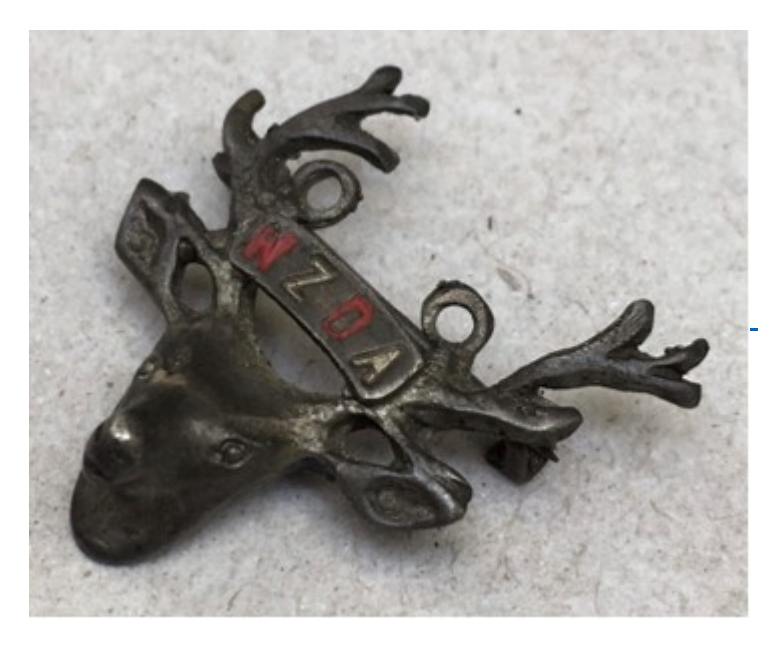
A rare pre-1957 NZDA membership badge